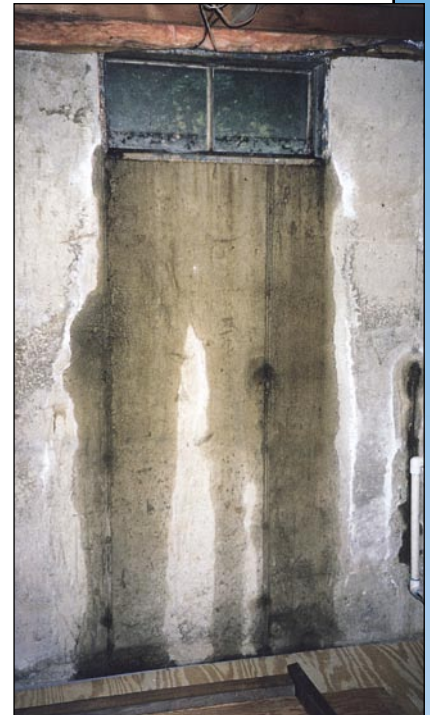
A leaking window well can cause major problems in a finished or unfinished basement!

We clean out your window well on the outside and fill it with clean stone and a grate. This allows the water to drain out of the well and through a hole we drill through the wall to the inside just below the window sill. Then the water runs down inside the WellDuct ® track to your basement waterproofing system where our powerful sumps pump it out. The drain hole through a block wall is sleeved with a pipe to prevent the water from going down into the wall. WellDuct ® has a sleek, contemporary design that looks clean & neat, and matches both the WaterGuard ® and DryTrak ® waterproofing systems.