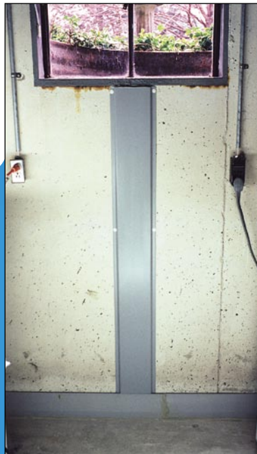
WellDuct ® solving leakage problem draining window well water into DryTrak ® System.