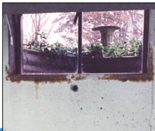
A hole is drilled below the window to allow the window well to drain.