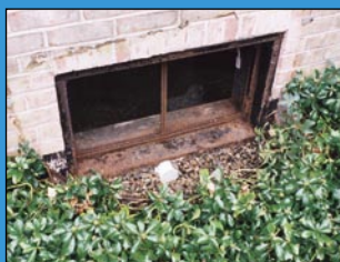
The WellDuct ® System includes, cleaning out the window well and filling it with clean stone and a grate to drain the window well water to the WellDuct ® .