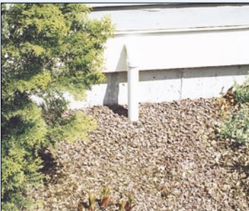
Sump discharge lines like this one can freeze.