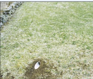
Pipe terminations like this one will be covered with snow and ice in the winter. This is not a problem if you have the IceGuard® System!