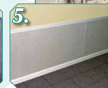
5. Install EverLast Wall Panels up to 32", finish with chair rail and trim. Install optional ThermalDry or Millcreek Flooring.