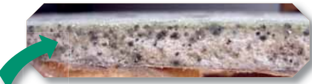
Mold can penetrate porous drywall, creating a very unhealthy living space.

The EverLast Finished Wall Restoration System uses only mold-resistant materials - with no vulnerable organic material. The EverLast Finished wall panels and trim are not prone to damage like drywall, wood moldings, fabrics, wood-based flooring, and wood framing. In fact, a basement refinished with the EverLast Panels can temporarily flood from a plumbing leak, inches deep, and it is highly unlikely that walls or trim will need to be replaced!