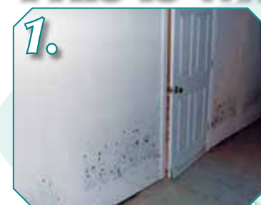
1. Damaged basement walls.