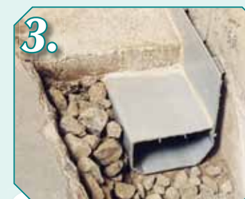
3. With the bottom of the finished wall removed a perimeter drainage system can be installed where it needs to be - against the foundation wall.