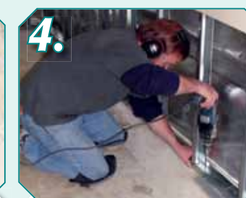
4. Replace the bottom of the wood studs with metal studs.