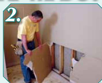
2. Cut and remove the damaged drywall and bottom of the studs.