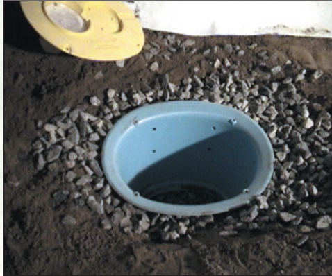
The base is back-filled with stone, and the CleanSpace liner is then installed over the base.

When there is a leak, the water naturally runs to the low spot where the SmartDrain™ is located.