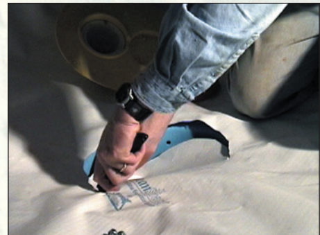
A hole is cut in the CleanSpace above the base.

The engineered shape of the cover requires the water to fill the alarm pocket first and then sound the loud WaterWatch alarm, alerting you to a problem. From there the water can flow down the airtight floor drain and into the base, which acts as a drywell, letting the water soak away into the soil under the CleanSpace liner, until you can fix the leak.