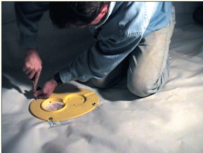
The specially engineered SmartDrain cover is bolted on tight to pinch the CleanSpace between the base and the cover.