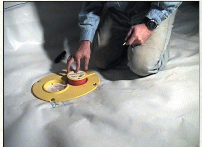
The WaterWatch alarm is then placed in the special recessed spot on the cover. The cover has Basement Systems airtight floor drain in it, which lets water down, but damp air from the dirt cannot come up into your crawl space.