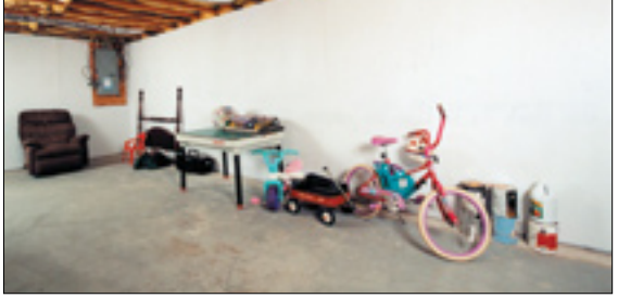
BrightWall® Paneling brightens your basement and gives it that clean, semi-finished touch.