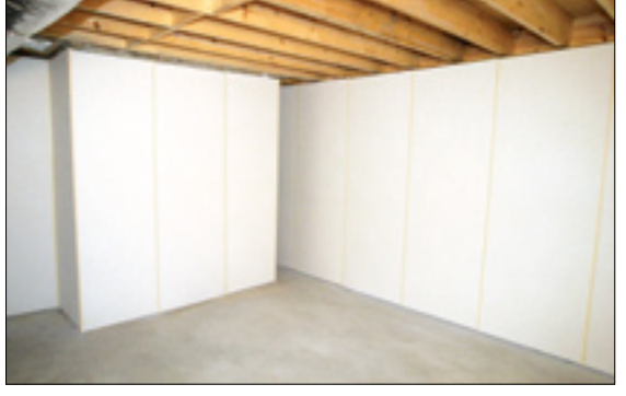
ZenWall provides that dry, clean, finished look while insulating and waterproofing your walls. This is the best looking solution!